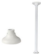
PFA106+PFB220C Adapter Plate + Ceiling Mount Bracket